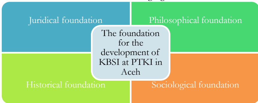
Figure 3. The foundation for the development of KBSI at PTKI in Aceh

(KBSI) as what UIN Ar-Raniry and STIS Al-Hilal Sigli have done. 33 The development of KBSI at PTKI in Aceh refers to four foundations, as shown in the following figure 3.