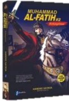
Figure 2: Islamic Comics Series 2 (Muhammad al-Fatih: The Resurrection)