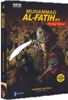
Figure 1: Islamic Comics Series 1 (Muhammad al-Fatih: Battle of Varna). 20